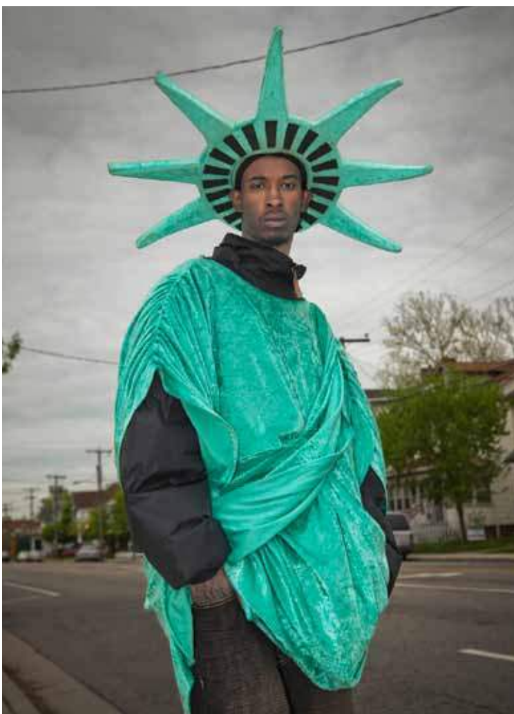
Greta Pratt, “Rodney Parker” from the series Liberty Wavers , 2010–2012, Photograph, 20 x 28 inches.